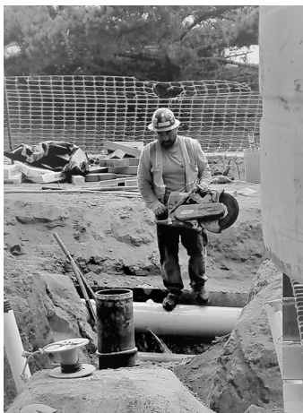
Installing a new water main at 16th Street & Cabrillo Highway. October 2018

RSVP online at mwsd.montara.org or call (650) 728-3545.