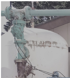
We are always working to stay ahead of age, rust, and corrosion.

We added new water tanks, installed a new groundwater well and new water treatment facilities, rehabilitated 7 of our 12 groundwater wells, begun pipeline replacements, added solar panels, improved our system technology by adding real-time monitoring and upgrading our meter reading technology. We've also ensured that our staff have efficient, ready to go equipment, generators, and vehicles should an emergency occur.